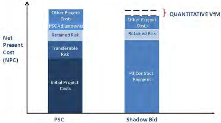
Figure 3: An Illustrative Outcome of a Quantitative Vfm Analysis